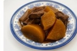
Braised Pork & Radish