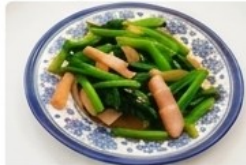
Komatsuna Green Stir-fry