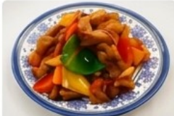
Pork & Veg. Sweet & Sour