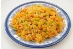
Gomoku Fried Rice