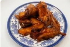
Chicken Wing Soy Sauce Stir-fry