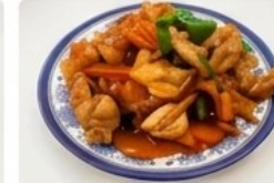
Sweet & Sour Stir-fry