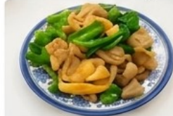
Bell Pepper & Pork Stir-fry