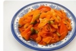
Tomato & Egg Stir-fry