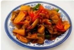
Huiguo Rou (Twice Cooked Pork)