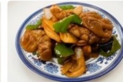
Black Vinegar Pork