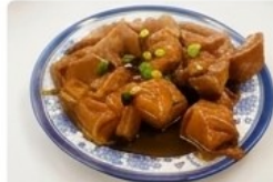
Braised Pork Belly